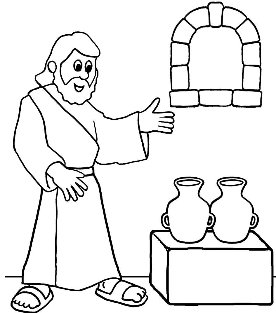
Jesus turned water into wine at a wedding in Cana.

Second Sunday after the Epiphany January 19, 2025