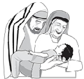
Simeon & Anna See Jesus

Jesus is the savior. The light that enlightens all nations. Simeon has been waiting his whole life for this. On this winter day, halfway to spring, we can finally see the light winning. Mary's tiny first born baby, redeemed with a humble offering of two doves, is God in flesh and blood. Jesus gave his own flesh and blood as an offering to redeem all people. These eyes of mine have seen the Savior, whom you have prepared for all the world to see. A light to enlighten the nations, and the glory of your people Israel.